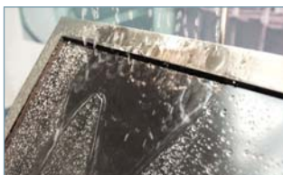
2. Rugged metal housing and NEMA 4 / IP 65 dust & water proof display front.