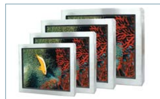
5. 12", 15", 17" & 19" wide range display size.