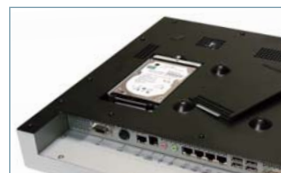
6. Slim HDD bay design for easy service.