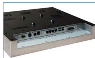
4. Rich I/O ports provide excellent peripheral connectivity.