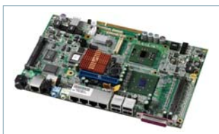
3. Intel mobile technology supports multiple processors from Fanless ULV CPU to high performance Celerm M, Core 2 Duo.